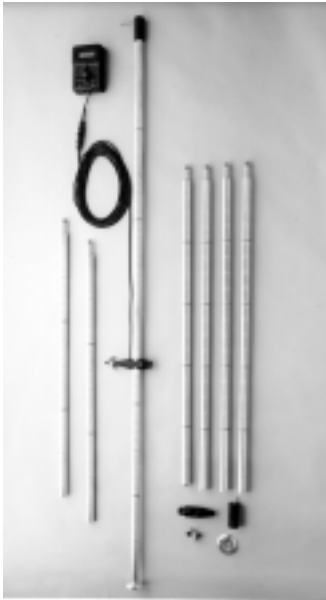
2100-1514 and 2100-1518 wands