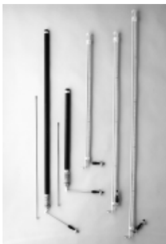
2100-STDx, 2100-LX, 2100-12, -13, -14 wands

PHOTO-FIBER-OPTIC two-conductor electrical with all electronics permanently encapsulated in epoxy resin.